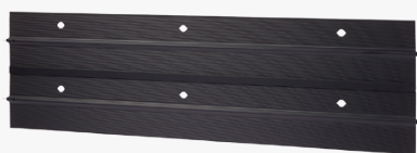
New Black Body Radiant Element

You don't need to sacrifice energy efficiency for luxurious heating comfort. Tatou drives down energy consumption to breakthrough lows. Meet the new generation 'black body' radiant plate element — an exclusive Tatou feature that replaces the traditional finned electric element found on convection panel heaters. Tatou's 'black body' plate technology means only 80 watts per square metre of room area is recommended when sizing a heater. Compare this with the 100 watts per square metre recommended for traditional panel heaters.