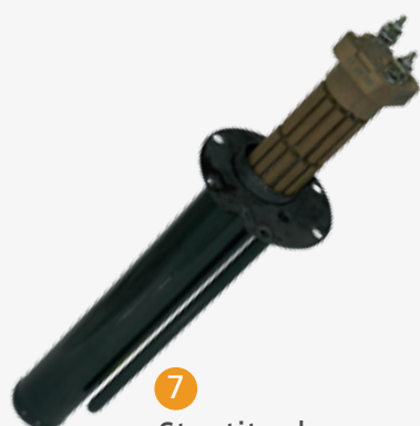
7 Steatite dry Heating element